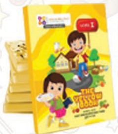
The Yellow Books- I & II for schools