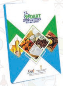
The DART book to test food adulterants