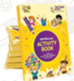
Activity Book for school children