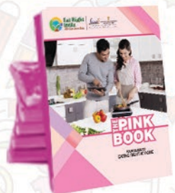
The Pink Book for homes