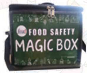
The Food Safety Magic Box to test adulterants